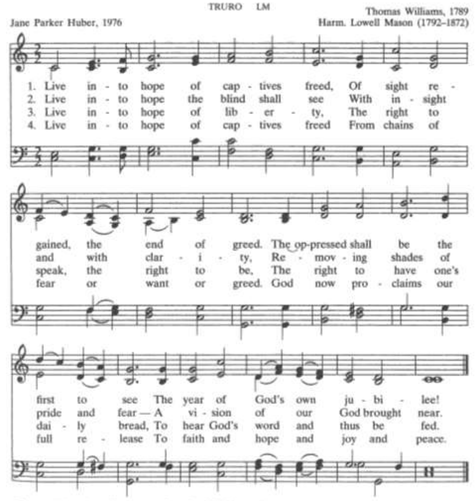
Test: © 1980 Jame Parker Huber; from A Singing Faith. Used by permission.